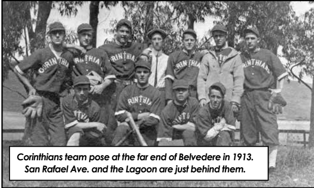
Corinthians team pose at the far end of Belvedere in 1913. San Rafael Ave. and the Lagoon are just behind them.