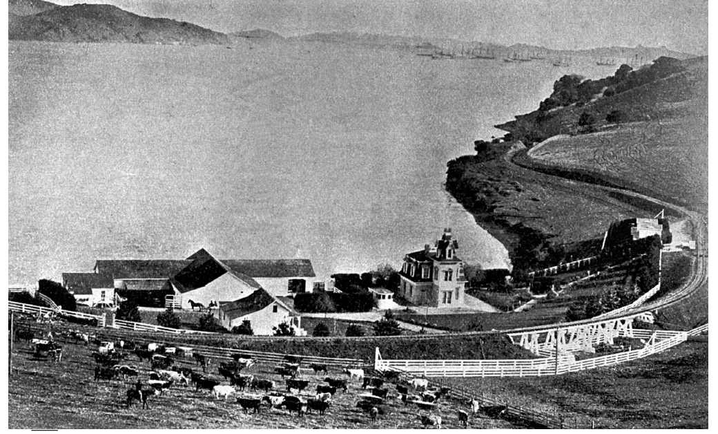
The Eagle Dairy Ranch circa 1888 from the Hygeia brochure. A picture of a "model dairy," with meticulous white washed buildings, fences and railroad trestle, the Lyford House in the center and the train station off to the right. Clipper ships can be seen in the distance anchored in the San Francisco harbor.