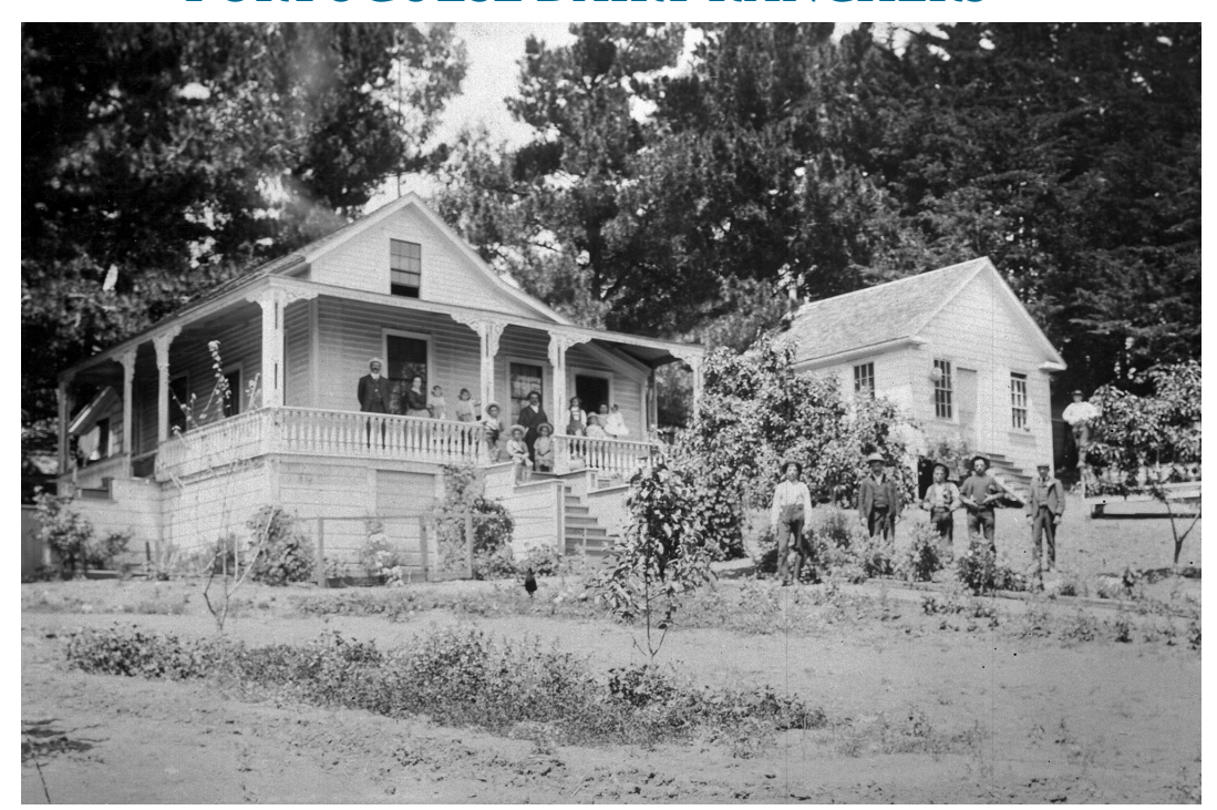
Silveria Ranch house at the former Eagle Dairy, circa 1915. The Silveria family on the porch with the other workers decked out in their Sunday best.

The Gold Rush of 1849 created an immediate market for dairy products in the boomtown of San Francisco. Southern Marin County with vast tracts of open fields and relatively easy water access to the big city provided an excellent location for dairy farming. The open spaces were mostly owned by Mexican land grantees who would build dairies and lease the operations to immigrant laborers. By the 1880's a large majority of these tenant farmers were Portuguese.