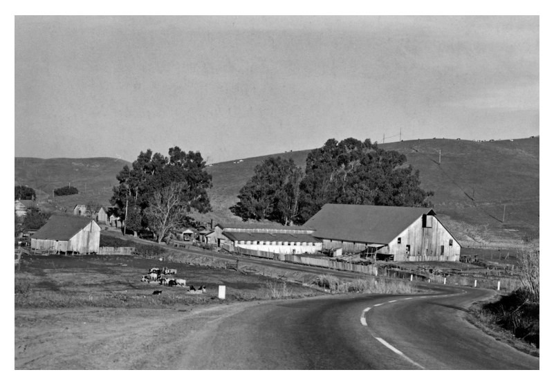
Little Reed Dairy Ranch circa 1940. The Tiburon Highway (now Blvd.) winds by the dairy, now the site of Del Mar School.