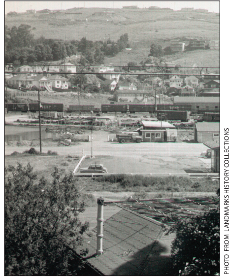
Old Tiburon, 1958

U.S. POSTAGE PAID PERMIT NO. 8 BELVEDERE-TIBURON, CA