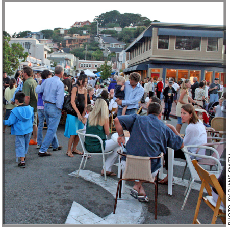
The crowd enjoying a recent Friday Night on Main