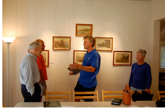
Landmarks Board Members and Staff enjoy the "Little Gems" exhibit.