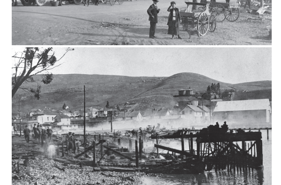
Main Street before the fire and after the fire in early 1920s. Look for the two railroad houses at the end of the street.

By the end of 1941 the United States was at war. "Although railroad workers in general were exempted from military service, many of them signed up anyway," according to Codoni. By mid-1942 90 NWP employees were in the service. This created a great shortage of workers for the railroad. Desperate for men (and women) to work for the railroad it placed ads for helpers for machinists, boilermakers, carpenters, mechanics, plumbers, offering liberal age limits, pensions, medical benefits, housing and rail