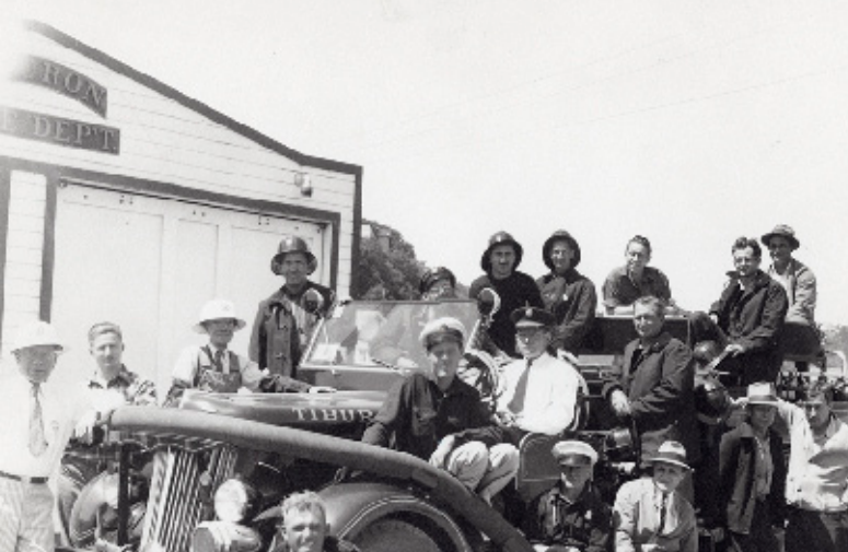
Tiburon Fire Department 1942