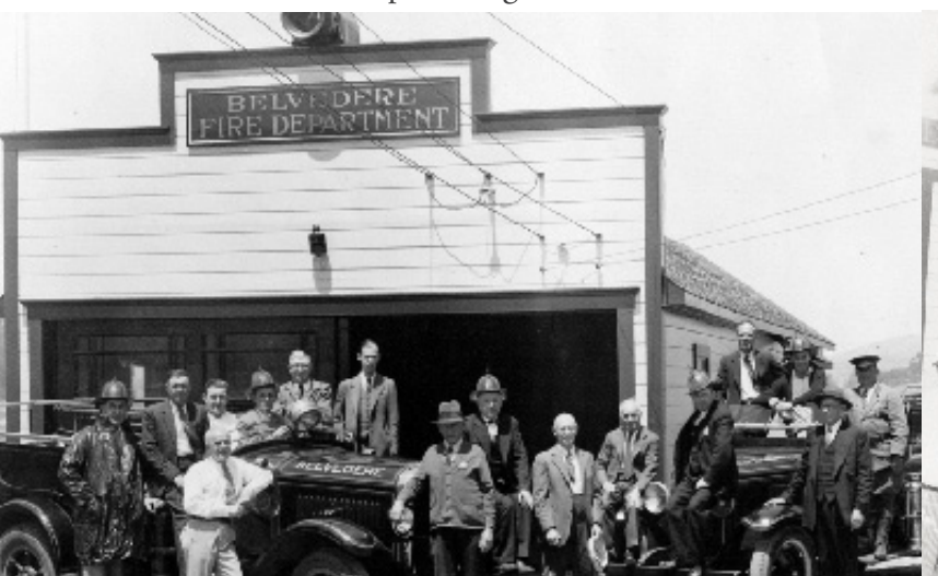
Belvedere Fires Department 1936

Bring a friend to see the newly revealed history! If you'd like to be a docent - and we could sure use your help - please contact the Landmarks office @ 435-1853 to learn more.