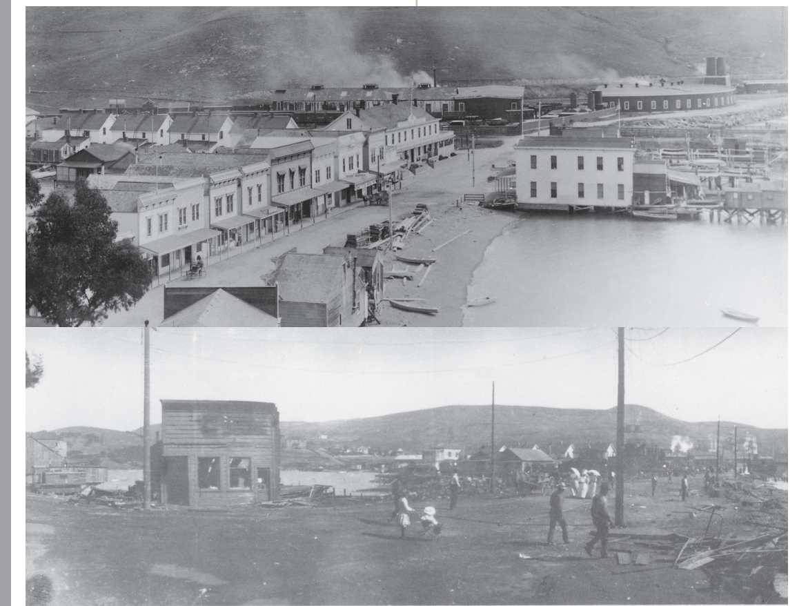
Main Street before and after the fire in early 1900s. Look for the tree on left and railroad housing at the end of the street. **Continued on page 3**

After the disastrous 1890 fire leveled the shacks on Water Street (renamed Main Street in 1911) there was an effort by a few individuals to organize a fire department, but it wasn't until 1899 when, with an arsonist