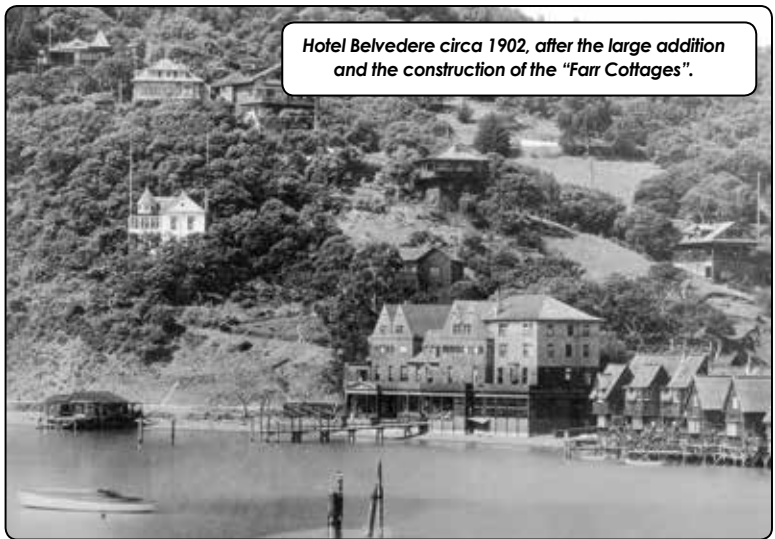
Hotel Belvedere circa 1902, after the large addition and the construction of the "Farr Cottages".